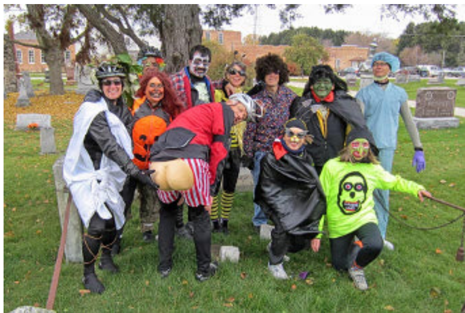
Last year's leftover ghouls, beasties and . . . . .