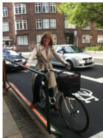
Copenhagen caters to cyclists by including such things as rails and footrests at stoplights.

Eleanor Beardsley, NPR, Weekend Edition, September 1, 2012